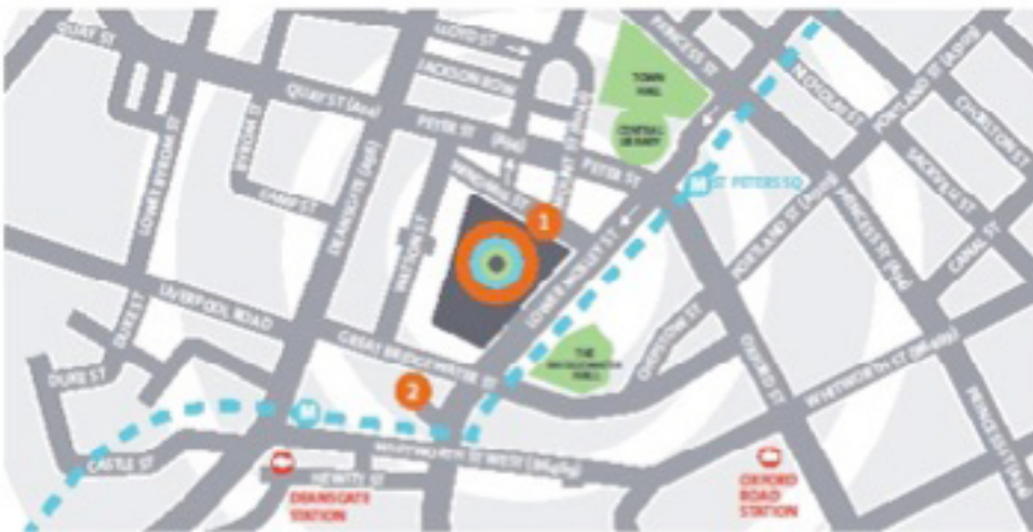
1 Delivery access to Exchange Hall: Windmill Street, M2 3GX