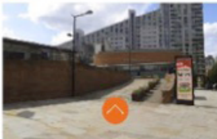
2 Delivery access to Central Halls & Charter Suite: Albion Street, M1 5LN