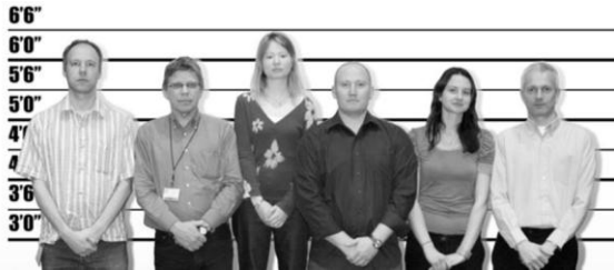
The APT Team