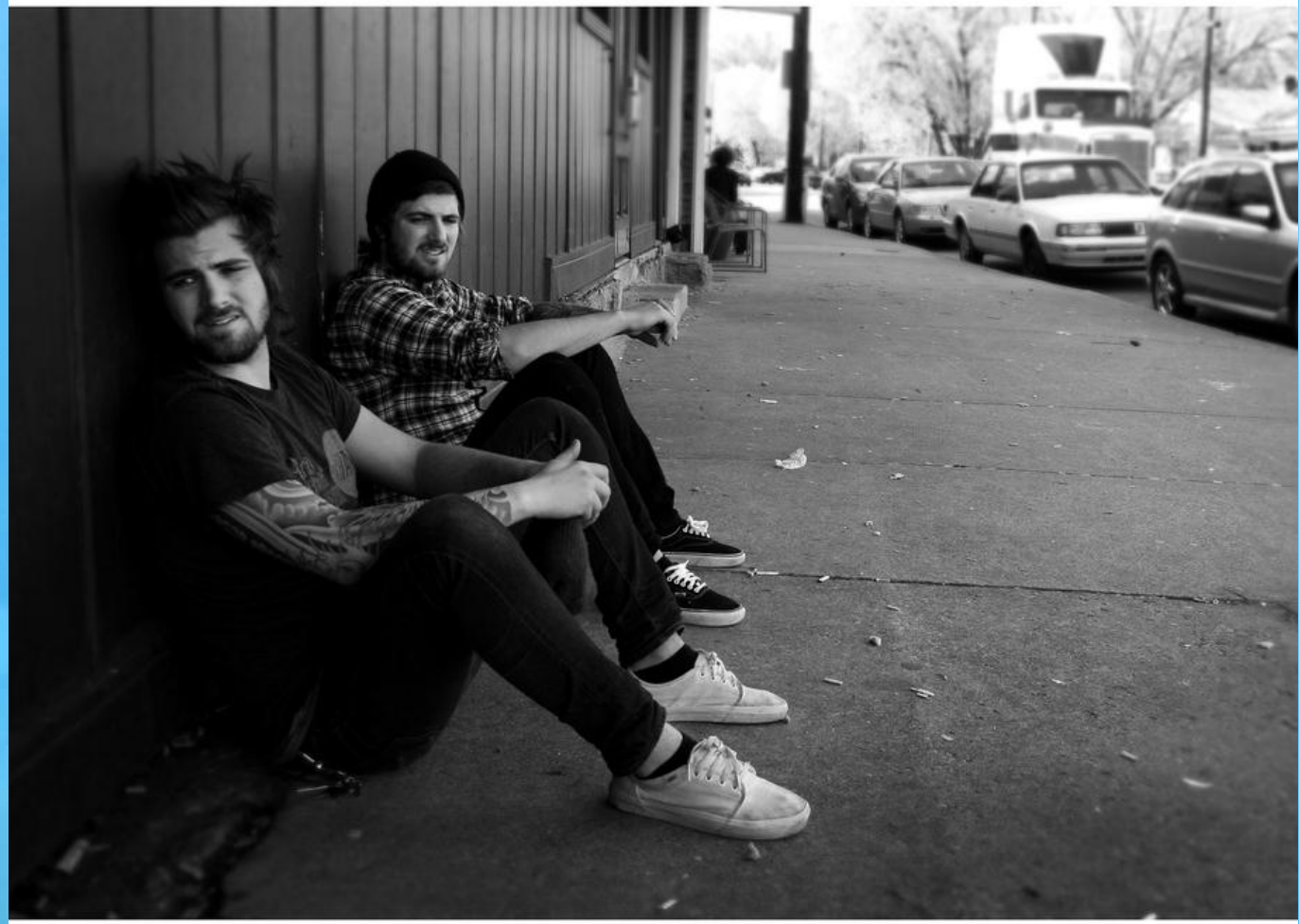
'The Twins'

Make it look like your site... ... but not a lot